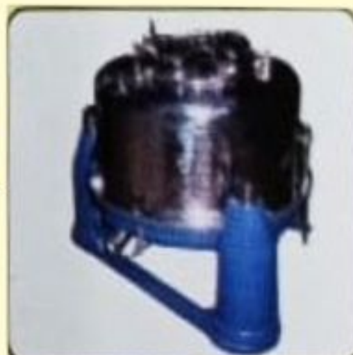
3PT STD MANUAL TOP DISCHARGE TYPE CENTRIFUGE