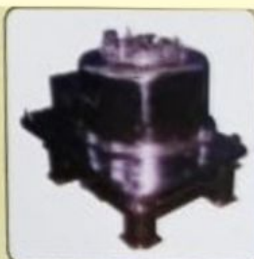
48" O FOUR POINT GMP CENTRIFUGE