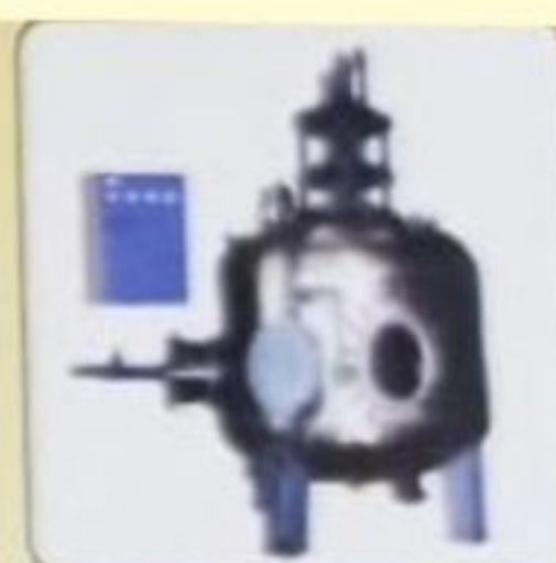
AGITATED NUTSCHE FILTER